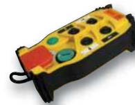
Handheld transmitter RE 5910