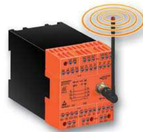
Wireless safety module BI 5910

Safety Integrity Level (SIL 3) in accordance with IEC/EN 61508